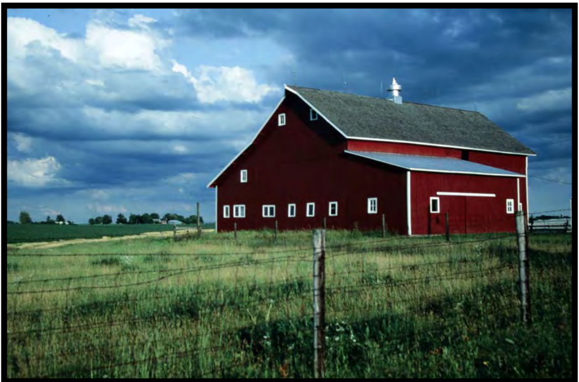
From the Mildred M. Banks Collection courtesy of the Boone County Museum of History, Belvidere, IL. Minimum bid: $200

Photo 12 x 18 plus frame & matting (not shown) 1st Place at Boone County Fair