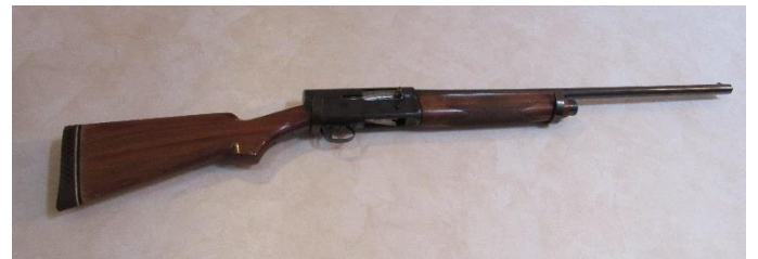
Remington Shotgun – Series #76634